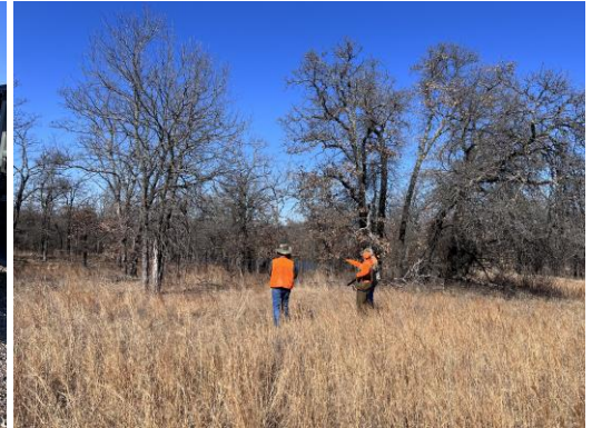
Flush em up boys, they went that way!