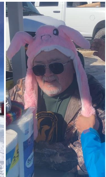
The Easter Bunny