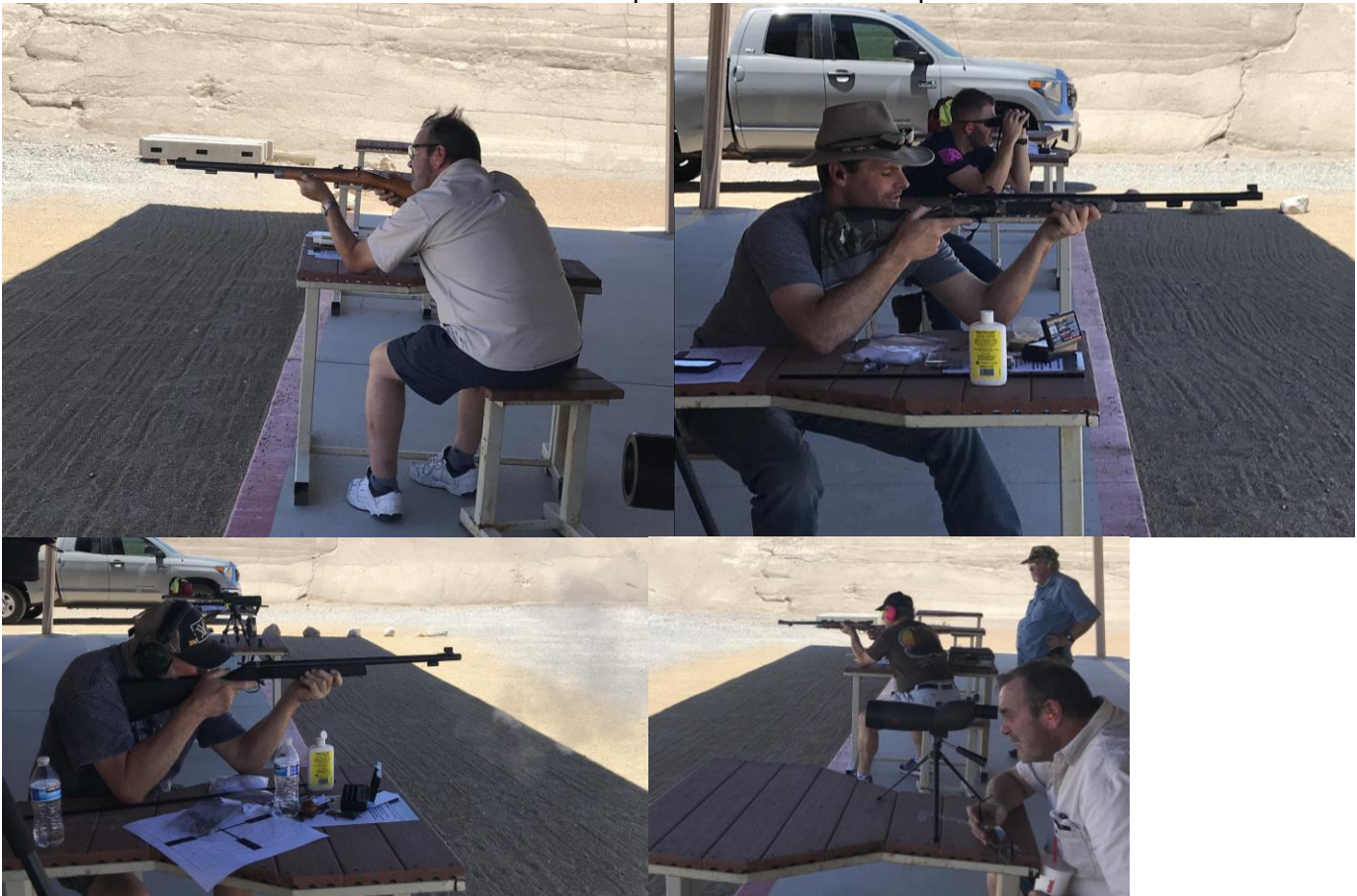
more photos from the black powder shoot