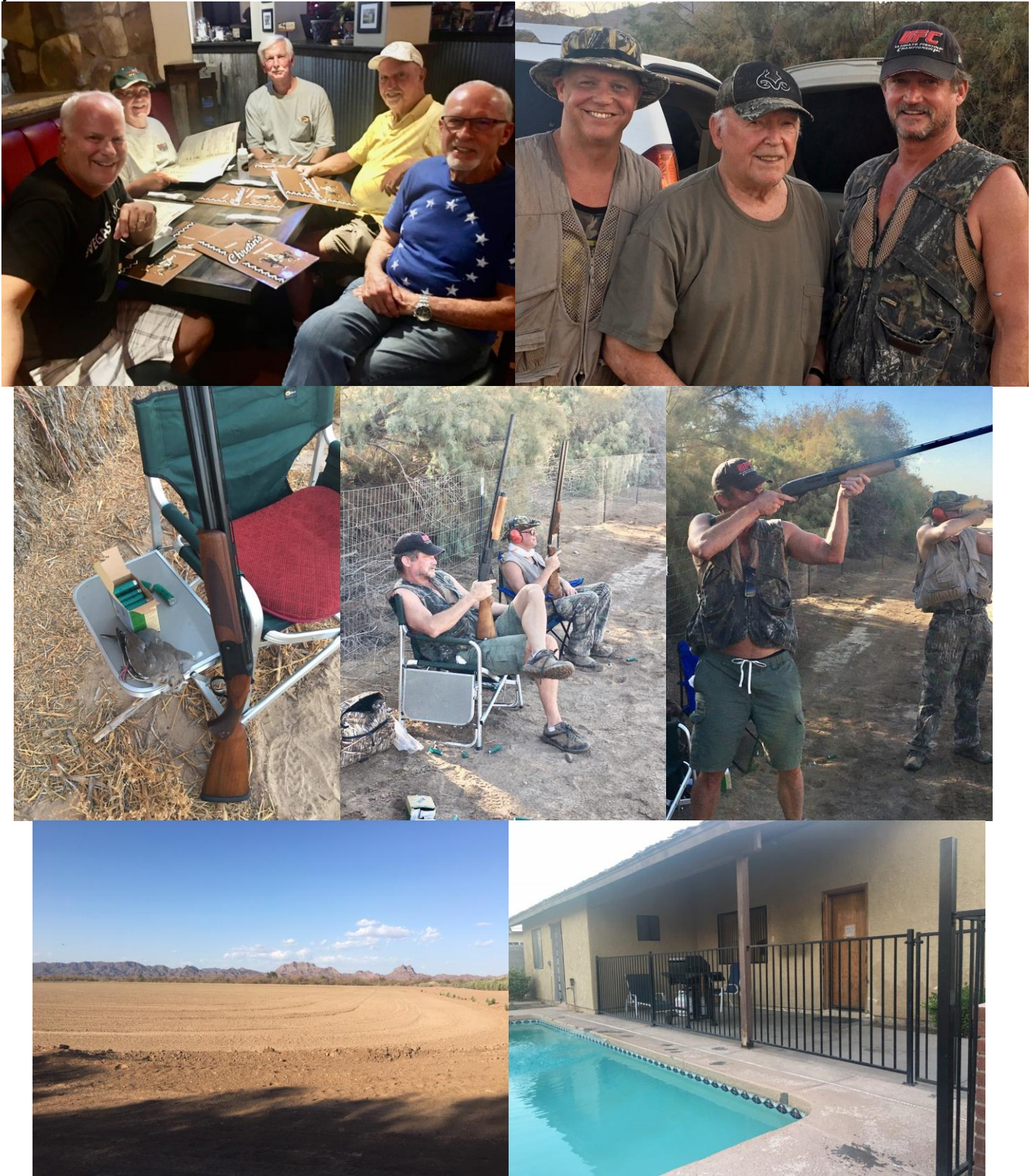
Some of the gang at dinner, in the field, on the hunt, the hunting fields and the accommodations after the hunt.