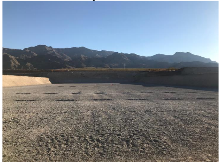
Here are the targets at 40 yards can you see them?