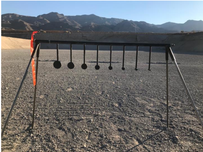
Here are the targets up close (2" dia down to 1/4" dia)