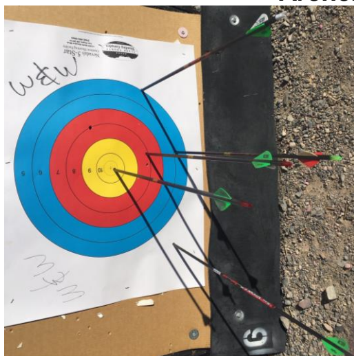
Someone got a bullseye