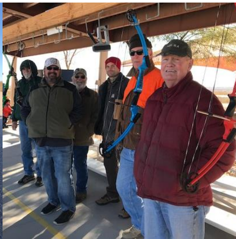
Crew waiting to shoot