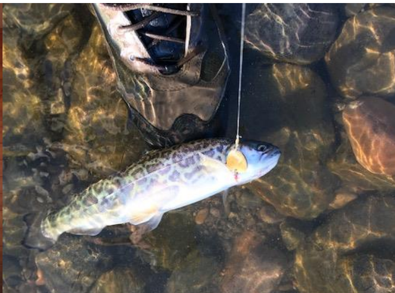
a smaller tiger trout caught and released Sunday morning