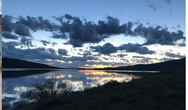
sunrise over the calm lake