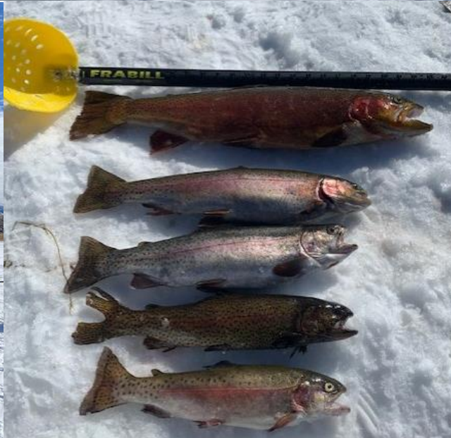
Top: Sam White, Niki White both with nice fish Bottom: Jack White with 23" awesome fish & family catch