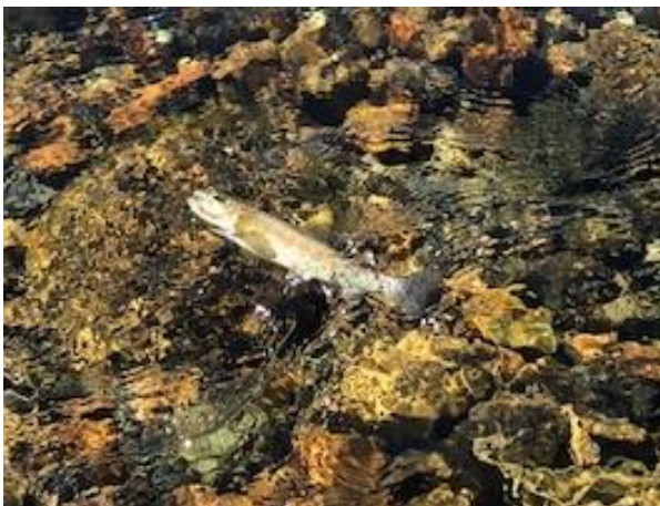
Golden trout on a dry fly

Summer is a great time to get out of Vegas and head to the high country for some cool air and great fishing. I recently went on a quick 3 day outing to California and the high mountains near Lee Vining and Yosemite. Yes you might have to deal with a few of those folks with California license plates but you also get to encounter some spectacular scenery and wild places over 10,000 feet in elevation. Those high mountain streams were the focus of our trip and we were not disappointed, LOTS of wild trout were very eager to hit our fly. In one small stream we landed brown, rainbow, brook and golden trout all in one short afternoon. To be fair we only got one rainbow and just a few golden trout but the brown and brook trout were plentiful.