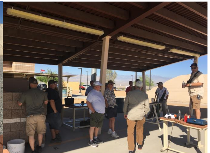
Safety briefing prior to the shoot