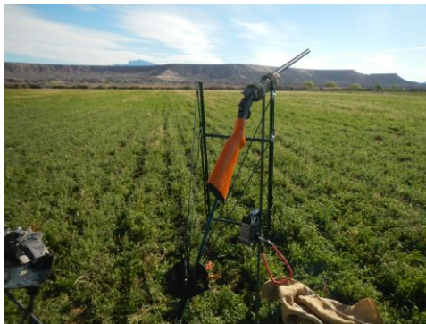
The winger station