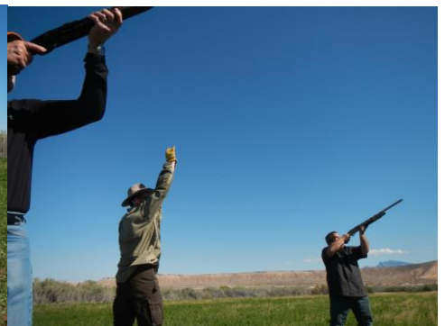
Let em fly!