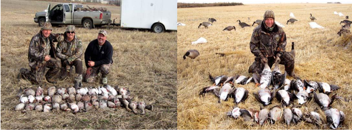
Al Schoelen goose and duck hunt from north of the border.