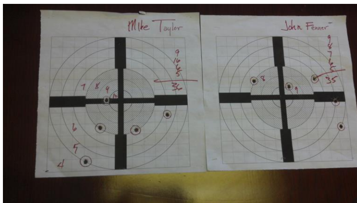
Black powder targets from the past, can we really call these groups Marksmen?