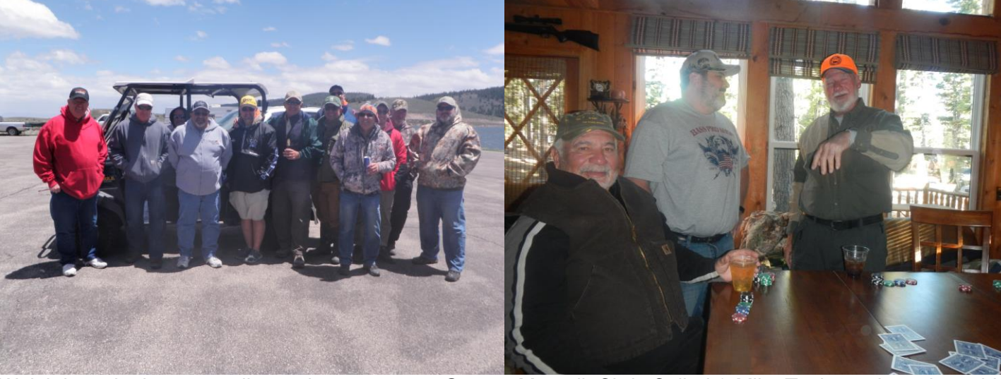
Weigh in at the boat ramp lies a plenty