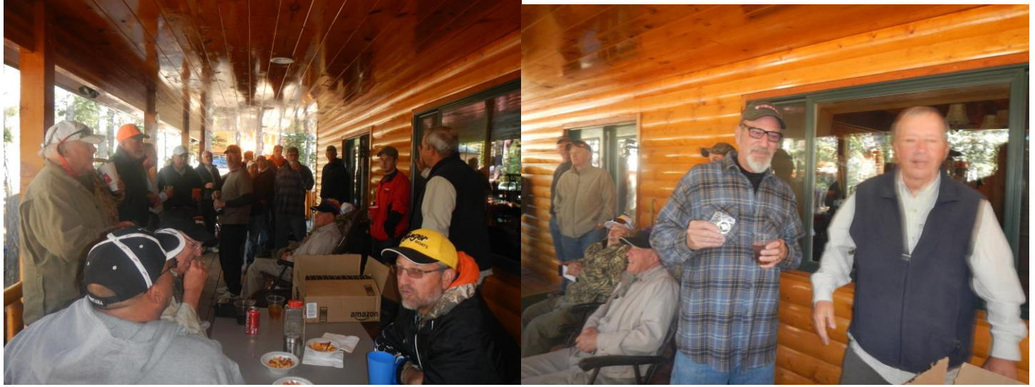
Part of the gang at the steak dinner