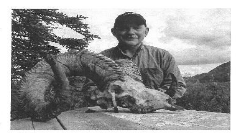
Keep polishing those pearls, keep adding them to your lifelong pearl necklace, and when you caress them, enjoy how those memories spring back to life. WS

Like a grain of sand, keep polishing those memories, culturing those pearls. Help a young boy or girl get started making their own memories. Like the bumper sticker says, "...hunt with your kids, rather than for them..."