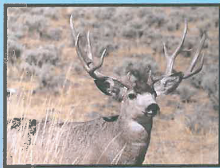
MULE DEER HERITAGE TAG UP FOR AUCTION