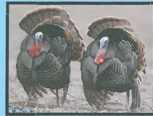
WILD TURKEY HERITAGE TAG UP FOR AUCTION