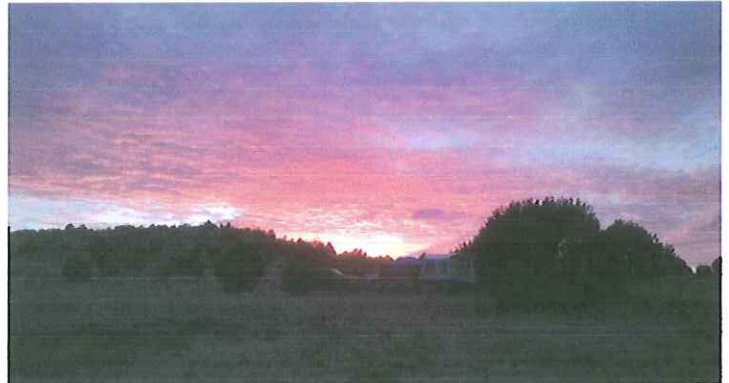
Craig Wrights view of elk camp.

March 15 WHIN Banquet at Gold Coast Hotel