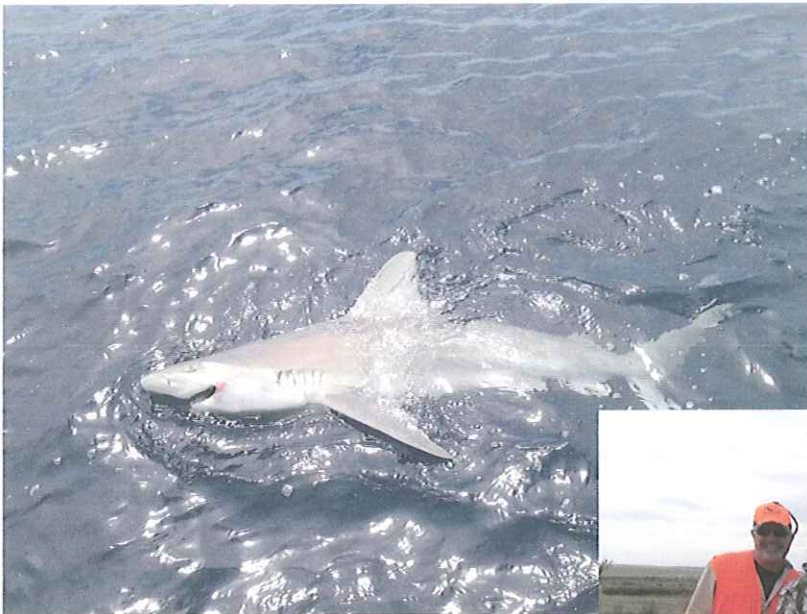
Sean Cassidy's Florida shark.

Hey guys here are two bucks my hunting friend Derrick and I took opening morning of the early rifle season. We were up near Kingston and got back away from the other hunters. 7 am we spotted 5 bucks together (one was a real nice 5 point). We put on the stalk and by 10 am lead was flying( I won't say how many shots it took but lets say I was out of bullets when my last shot took mine down). Of course the big boy got away only to be missed again the following weekend by others in our camp. It only took us 8 hrs to get em quartered up and back to camp! The drinks went down easy that nite!! Art Daniels on the left Derrick on right.