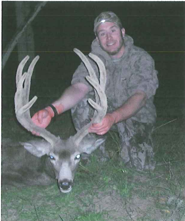
2013 Muzzleloader Utah buck