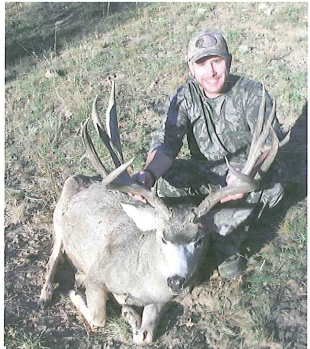
2012 Rifle Utah buck