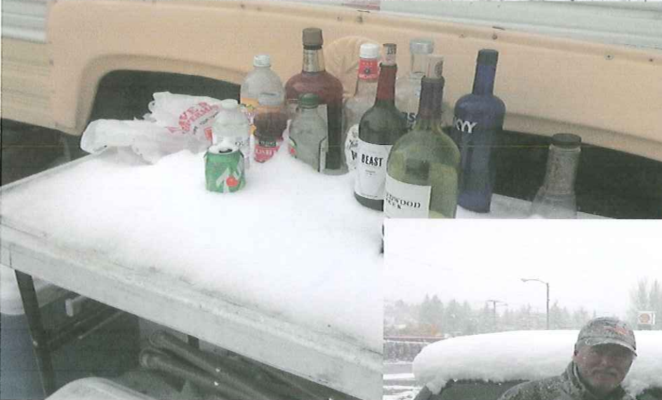
Top left: Opening morning bull session, Top right: non-typical bull on the ground. Left: Cool morning breakfast, Bottom: Steve Carpenter and Nelson Stone headed in for lunch in Ely.